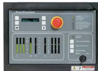
PowerCommand 2100 control Operator/display panel